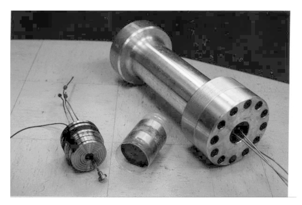
Fig. 1 The above photo shows the pressure vessel, (on the right), the sandstone core incased in plastic (center) and the stainless steel head (left). The transducer is also visible hanging out of the head.